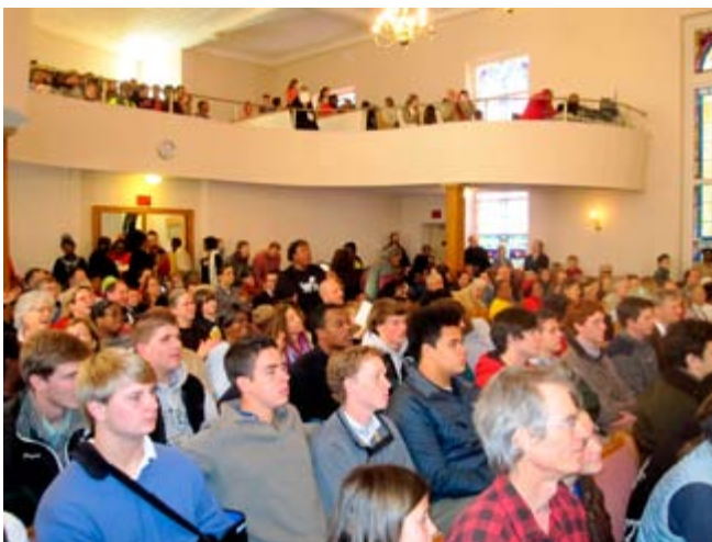
A rapt crowd listened, prayed, and sang at St. James AME Church before the January 20 Peace March