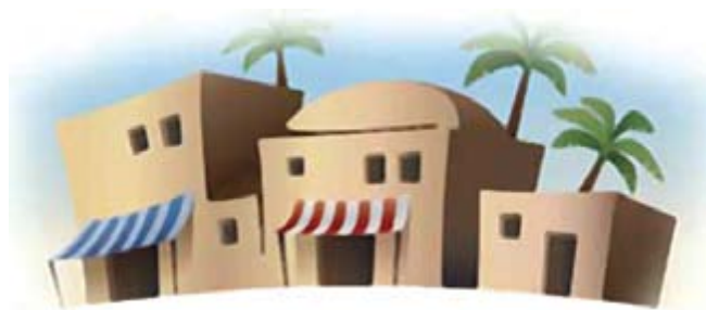
Market Place 29 A.D.

Our next Catechesis cohort begins March 8, 2014. The group is limited to 15, and I expect it to fill quickly. I pause to imagine and, as with that old kaleidoscope, I anticipate the beauty that is waiting to be revealed. Please contact me ( micki@allsouls cathedral.org ) if you are interested in joining.