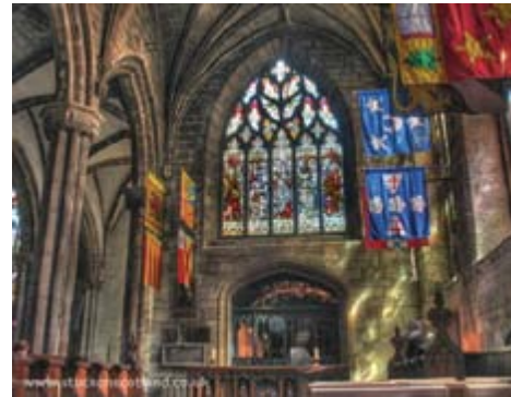
St. Giles Cathedral, Edinburgh